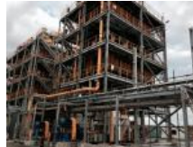
IMG worked on the dry sand modules at Taharoa (click to enlarge)